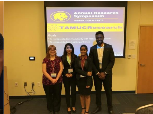
Numerous students presented research at the TAMU annual Research Symposium. All graduate assistants collaborate with faculty as part of their positions in the COB.