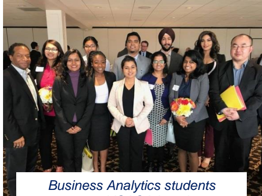
Business Analytics students attend ISACA Lunch