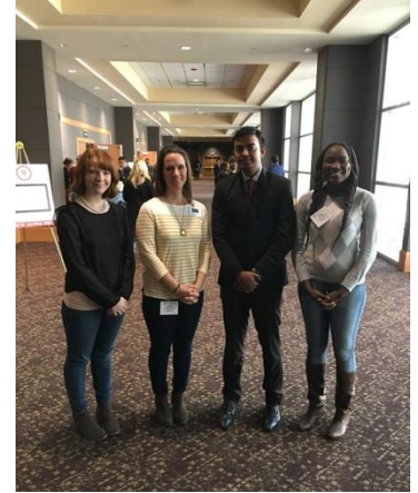
Accounting students attend Beta Alpha Psi Regional Meeting