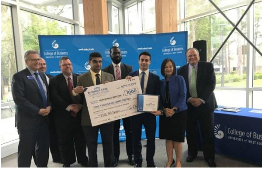
Finance students receive case competition award at University West Florida

I continue to be WOWED by the exceptional faculty and students in the College of Business! Although one would expect them to be prolific authors, many are also engaged in helping students expand their horizons beyond the walls of a classroom!